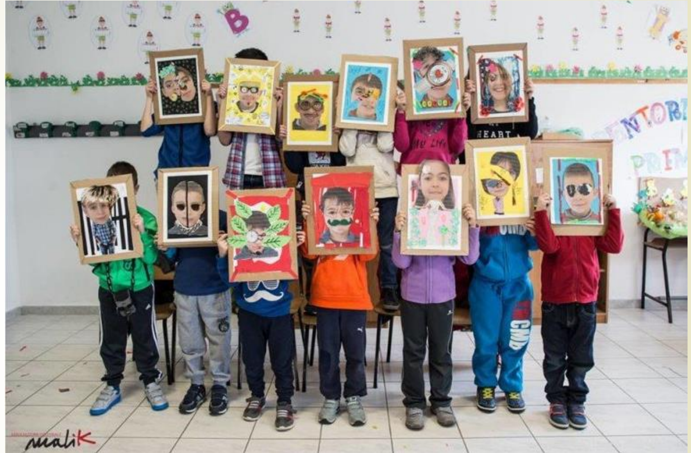
CHILDREN FROM SEULO AT TORIN'S "Salone Del Libro"

Since 2010 Malik implements once a year the project “Books help to read the world”, aimed to promote reading and literature: the initiative involves several municipalities, schools, associations and NPOs all over Sardinia.